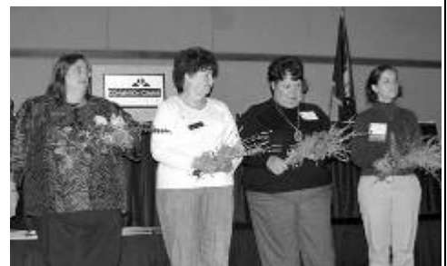
(Below) Officer installation ceremony after the district networking breakfast.