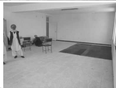
(Left) A view of one of the classrooms in Kapisa, Afghanistan.